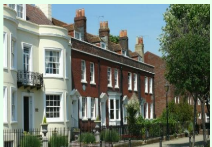
Charles Dickens' Birthplace, Portsmouth