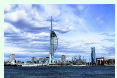
Portsmouth Waterfront - Spinnaker Tower