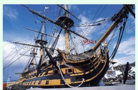
Nelson's ship "HMS Victory", Portsmouth